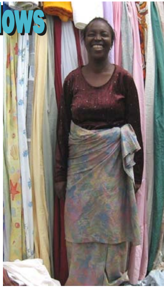
D. R. Congo Widow selling cloth as her micro-enterprise.