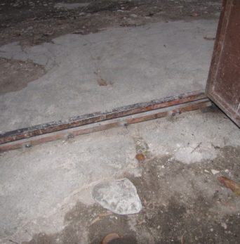
Compound Front Gate: The rollers were repaired/replaced and the bent rail track was straightened and secured