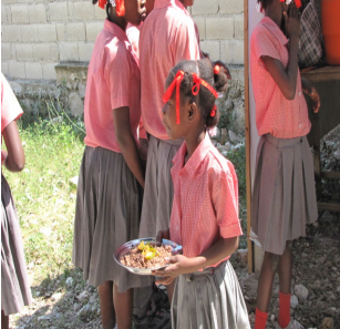
For Many, this is the ONLY hot meal of the day